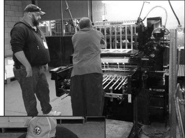
FP Horak printing staff

The Michigan Duck Stamp program started in 1976 with a requirement of all Michigan waterfowl hunters age 17 and older to carry a signed stamp, which at that time cost $2.10. In 1998, due to legislative action and the new computerized retail licensing system, Michigan hunters were required to obtain a waterfowl hunting permit, which at that time cost $5. A physical duck stamp was no longer required. However, In 1999, the Michigan Duck Hunters Association signed a Memorandum of Understanding (MOU) with the Michigan Department of Natural Resources in order to keep the actual stamp program alive. Since that time the MDHA has been responsible for the annual competition, printing and distribution of both stamps and prints. Per the MOU, the DNR receives 10% of the net profit from all print sales. According to the DNR, since its beginning in 1976 through 2010, the sales of Michigan duck stamps, prints and waterfowl hunting permits have raised $7.4 million dollars, which is used exclusively for wetlands acquisition in Michigan.